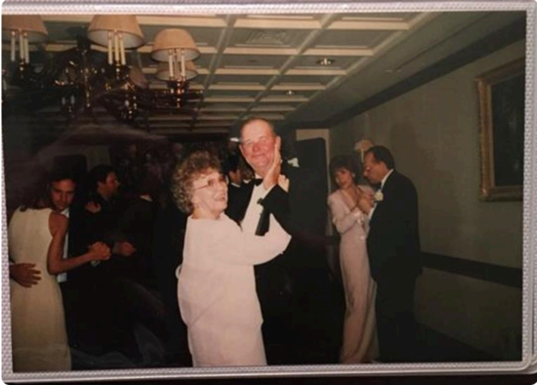
Dad and mom 1997.