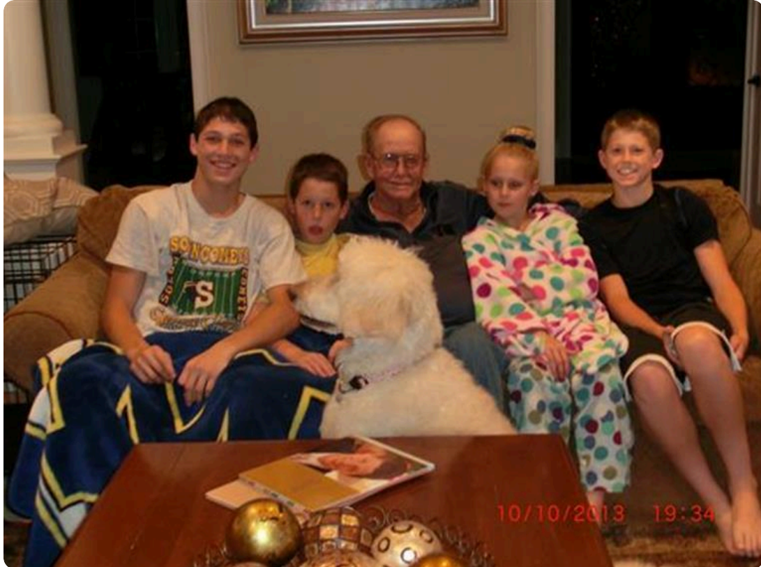
Dad with grandchildren October 2013.