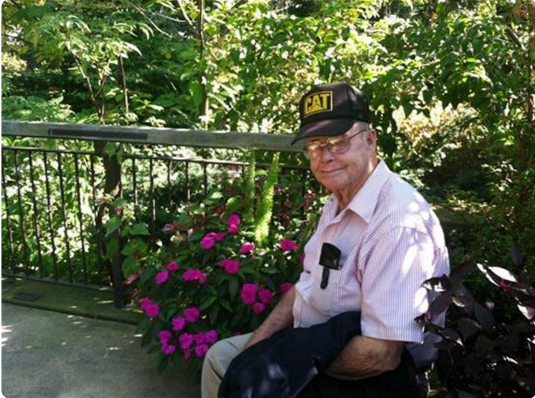
Dad October 2012 in Ohio.