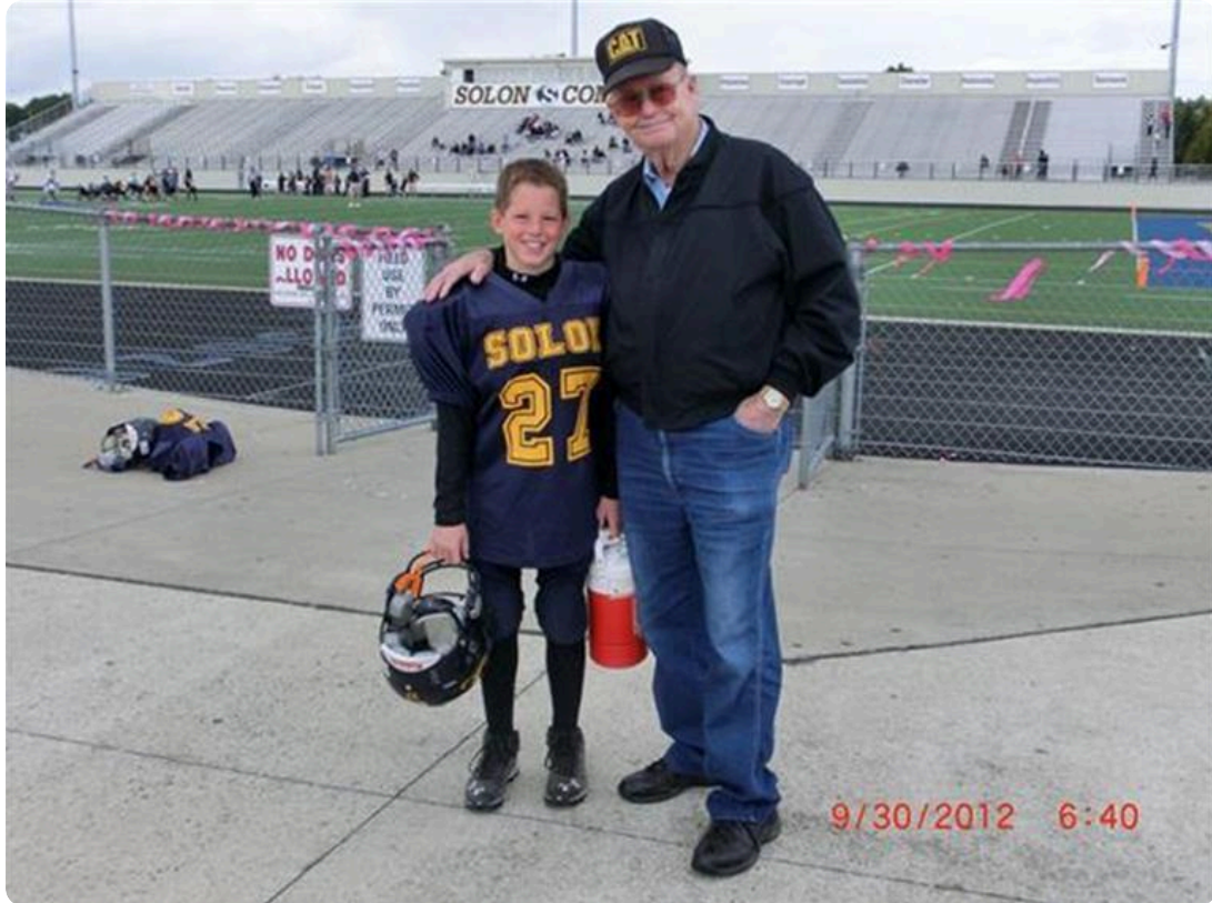
Dad with grandson October 2012.